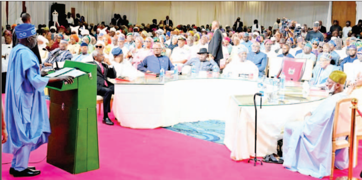
L-R: President Bola Ahmed Tinubu; Chief of Staff to the President, Femi Gbajabiamila; Secretary to the Government of the Federation, George Akume; Former Sierra Leone President, Julius Maada Wonie Bio; Former President Goodluck Jonathan; Former Head of State, Yakubu Gowon; Former Head of State, Ibrahim Babangida and Former Head of State, Abdulsalam Abubakar during the Book launch of IBB title "A Journey in Service" held in Abuja on Thursday