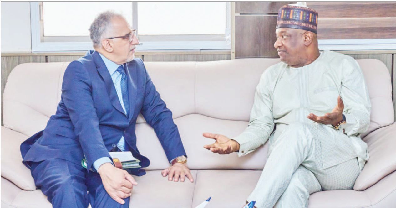
L-R: Ambassador of Algeria, H.E. Mezoued Hochine during a courtesy visit to the Honourable Minister of Aviation and Aerospace Development, Festus Keyamo, seeking approval for Air Algérie's new flight route from Algiers-Abuja-Douala recently in Abuja.