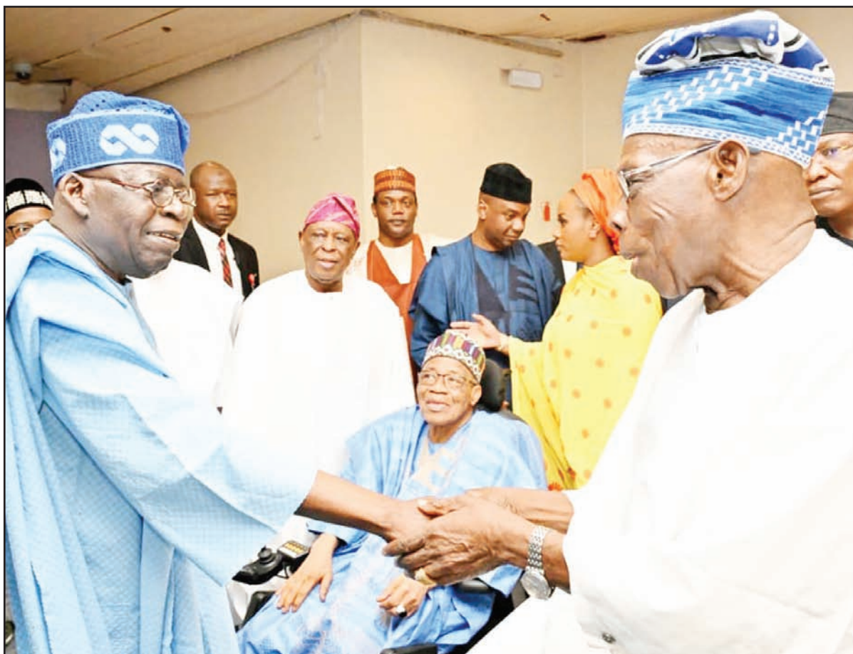
L-R: President Bola Ahmed Tinubu; Former Ogun State Governor, Olusegun Osoba; Former Head of State, Ibrahim Babangida; and Former President Olusegun Obasanjo at the IBB book launch titled "A Journey in Service" held in Abuja yesterday

Despite illegal self-help by APC Chairmen, we will uphold rule of law, hold election — Adeleke assures P3