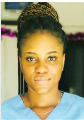
Types and Causes of Hypertension 1. Primary (Essential) Hypertension

sac called the pericardium, which prevents friction and trauma. Normal blood pressure ranges between 100/60 mmHg and 140/90 mmHg. Any reading below 100/60 mmHg is classified as hypotension, while readings above 140/90 mmHg indicate hypertension. Blood pressure is measured using a sphygmomanometer, also known as a BP monitor. There are two main types: Digital BP Monitors. These are easy to use and display the exact reading automatically. Or Manual Mercury BP Monitors. These require a stethoscope to listen for blood flow sounds and are considered less user-friendly. Due to mercury pollution concerns, countries like Sweden, the Netherlands, and the Philippines have banned them. Classification of Hypertension 1. Elevated BP: Systolic pressure of 120-129 mmHg and diastolic pressure below 80 mmHg. 2. Stage 1 Hypertension: Systolic pressure of 130-139 mmHg or diastolic pressure of 80-89 mmHg. 3. Stage 2 Hypertension: Blood pressure exceeding 140/90 mmHg.